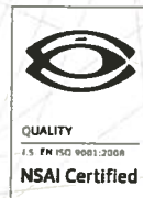
Approved by: Maurice Buckley CEO NSAI

The design, supply, installation, testing, commissioning and maintenance of mechanical, electrical, instrumentation, sprinklers and fire protection services and the design, construction and commissioning of BioEnergy facilities.